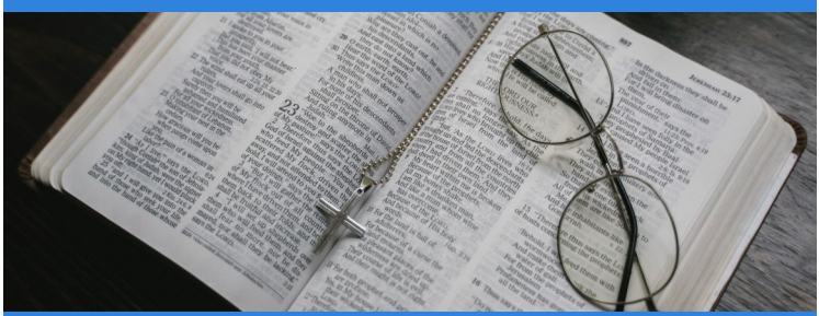
Wednesday Bible Study

If you have any questions, please call the office at 218-675 -6300 or email the church at <u>unionucc401@gmail.com</u>.