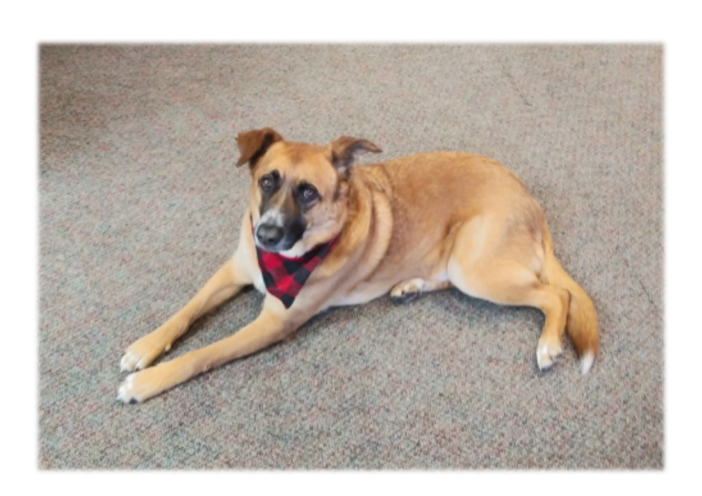
Caesar decided to take a well-earned break from peeling potatoes!